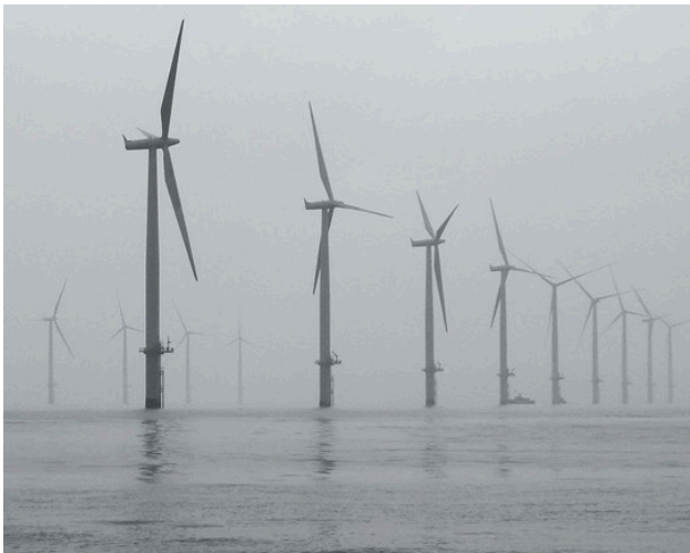
Wind and solar are already “modular”

Modular means SMNRs can be mass produced in a factory and the parts then assembled on site. But we already have modular energy, especially factory-produced solar as well as multi-turbine wind farms.