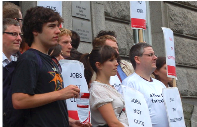
We need jobs now for our youth

Fantasy figures: The promise of hundreds of jobs for Wales is an illusion. SMNRs will be manufactured in factories elsewhere and only assembled on site. The job figures will be far lower and short-term.