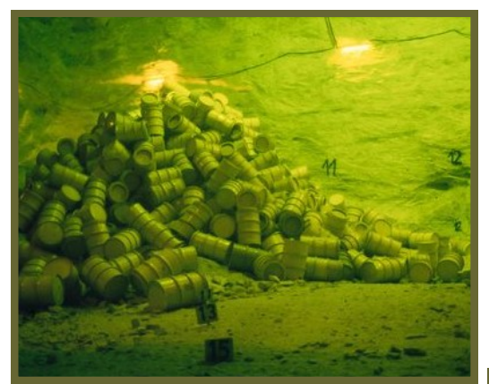
Because nuclear power generates radioactive waste — a mountain of waste 70 years high in the US. With no waste management "solution" in sight, it is unacceptable, and immoral, to continue to generate more.

Because a safe and secure future will be powered by renewable energy, supported by energy efficiency and conservation. It is our responsibility to ensure such a future, for our children and theirs.