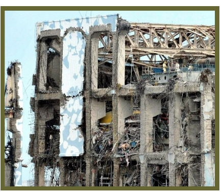
Because nuclear reactors are inherently dangerous. Safety fixes are sacrificed in favor of industry profit. But a nuclear accident anywhere is a nuclear accident everywhere.

Because no one should have to live in a house made of radioactive debris. Yet from uranium mining to waste dumps, nuclear power violates human rights, often targeting indigenous peoples around the world to bear the burden of risk and disease.