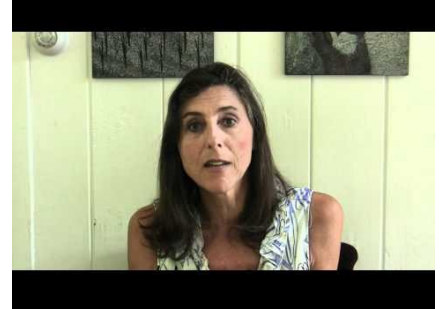
Votare si per dire no al nucleare!