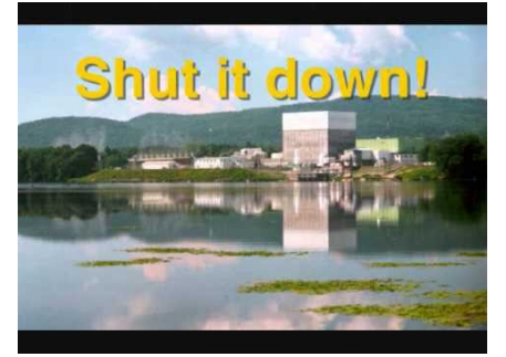
VY, unsafe today, shut tomorrow!