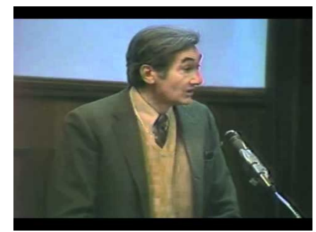
Howard Zinn, civil disobedience