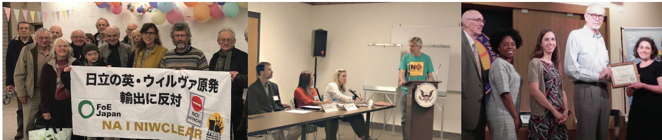
We joined Welsh activists to defeat Wylfa (left), spoke to NRC in New Mexico about radioactive waste (center) and awarded the City of Takoma Park its UN Treaty on the Prohibition of Nuclear Weapons compliance certificate, the first in the US (right).