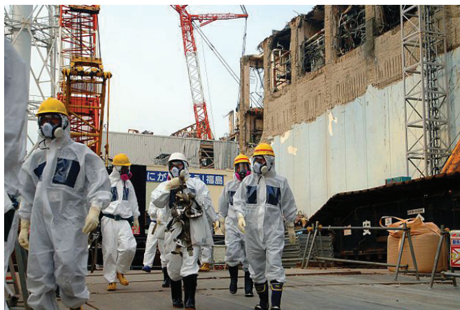
IAEA experts depart Unit 4 of TEPCO's Fukushima Daiichi Nuclear Power Station on 17 April 2013 as part of a mission to review Japan's plans to decommission the facility.

What took so long? First, steel braces were built to bolster the pool floor, so it wouldn't simply drop out. Then, an exoskeleton had to be built, to stabilize the reactor building, so it could support the necessary crane. A new roof had to be added as well. Finally, in November 2013, fuel removal began. That job took a year to complete.