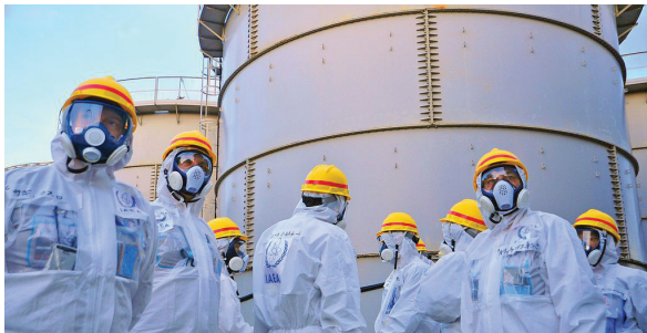
Radioactive water storage tanks are at capacity and some are leaking.

The Fukushima catastrophe has resulted in the release of radioactive fallout into the atmosphere and the discharge of radioactive liquid effluent into the Pacific Ocean. Radionuclides released include cesium 134, cesium 137, strontium 90, plutonium 239, iodine 131 and tritium.